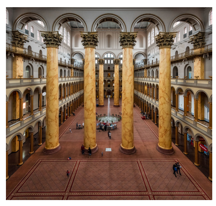
A Both the 85th anniversary of the U.S. Securities and Exchange Commission and the 20th anniversary of the founding of the SEC Historical Society, will be commemorated with a dinner on Monday, June 3, 2019, at the National Building Museum in Washington, D.C.