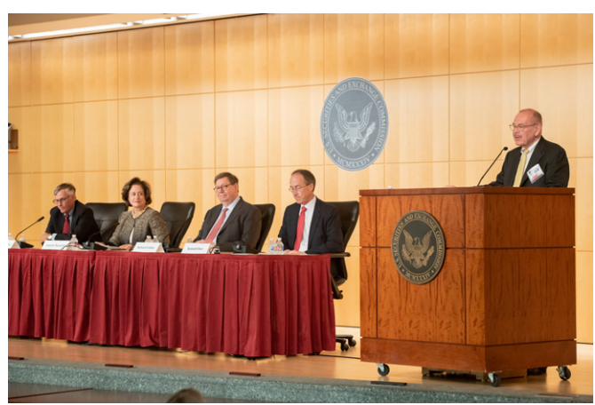
▲ (Top) April 3, 2018 Enforcement Directors Roundtable (Bottom) June 1, 2018 Panel on Regulation and Market Structure from ATS to NMS