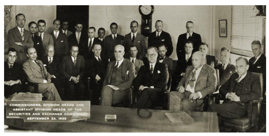
▲ September 23, 1935, SEC Commission with Senior Staff