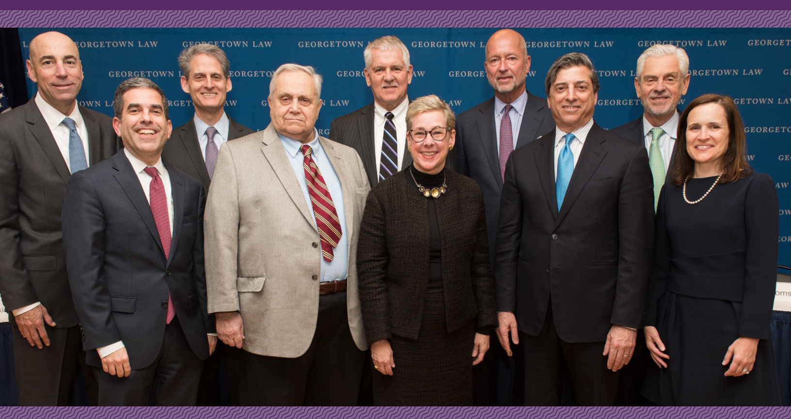
April 3, 2018 - Roundtable of SEC Enforcement Directors