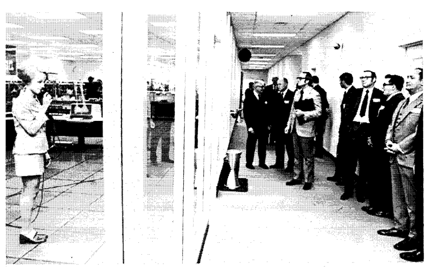
TRUMBULL TOUR: Bunker-Ramo recently hosted NASD staffers and the press in a sneak preview of the NASDAQ system. Above: The group listens to an explanation of the functions of the NASDAQ Computer Center.

The central computers that drive the NASDAQ system are located in a new building erected by the Bunker-Ramo Corporation (the NASDAQ contractor) in Trumbull, Connecticut. Tied in by high speed transmission lines to the central computer complex are three levels or types of service for investors, retail stock brokers and market makers or wholesalers.